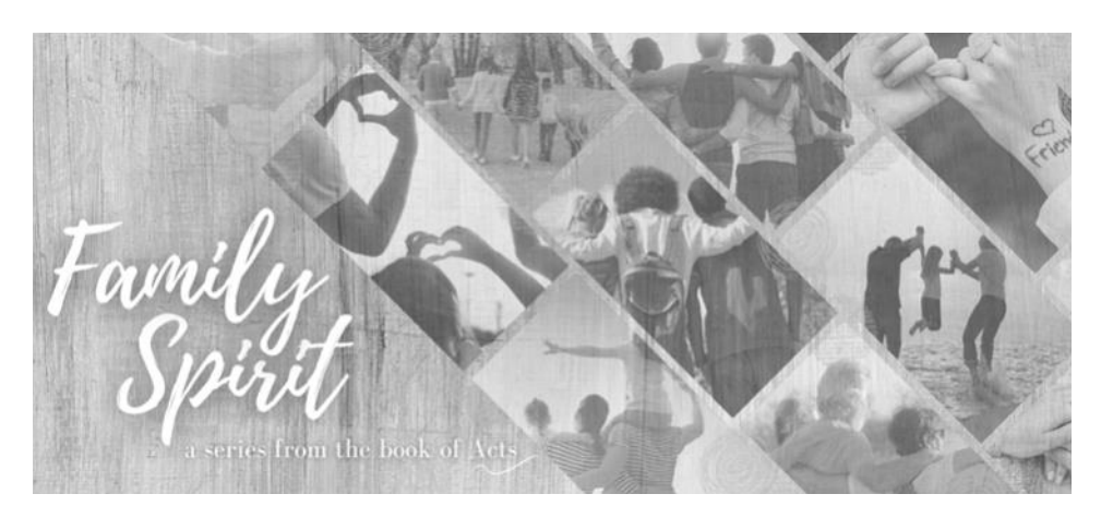
October 15 | Sermon Notes