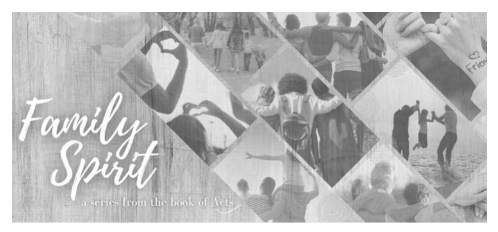
November 19 | Sermon Notes