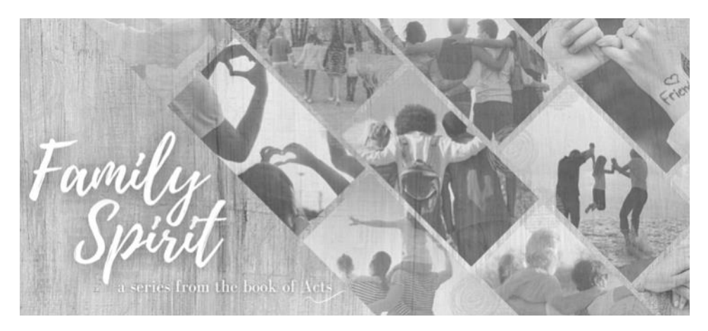
October 29 | Sermon Notes